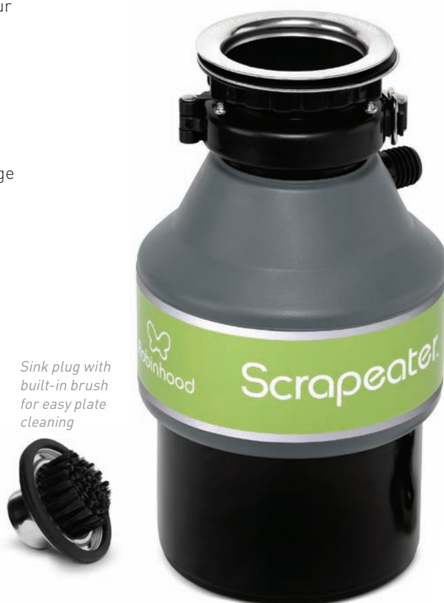
Sink plug with built-in brush for easy plate cleaning

Due to ongoing research and development, the manufacturer reserves the right to change specifications without notice. If specifications are important to end use, please ask your merchant. Terms and conditions are subject to change without notice. Brochure issued January 2010.